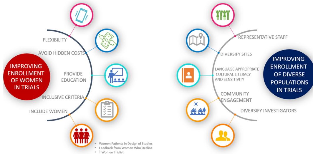
Fig. 1. Improving Diversity in Enrollment.

are more likely to perceive harm from trials; however, they were more influenced by monetary incentives [35]. Another survey found that reasons that favorably influenced women's decisions to participate in trials were trust in their clinicians and belief of benefit for others or themselves [36].